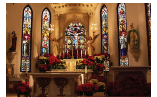
December, 2020 Christmas Social