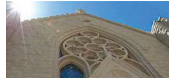
August 2020 Summer Social

Please join Legatus members from the Fort Worth chapter for Holy Mass, dinner, and an evening of fellowship.